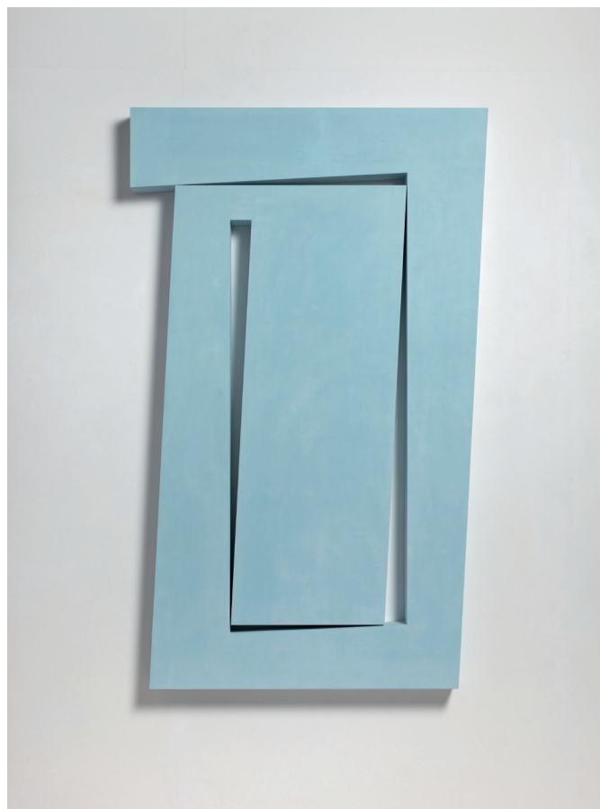
Four Turns: Vertical Format , 2005, Acrylic with marble powder on plywood, 178 x 120 x 10cm