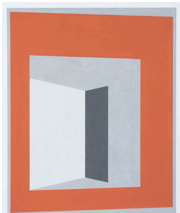
In the Frame II , 2020, Acrylic gouache on paper, 31 x 25.2cm