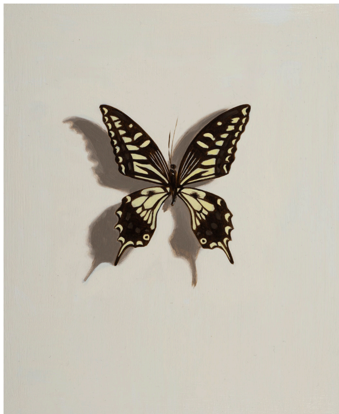
Pinned V 2017 Oil on board 21.5 x 17cm