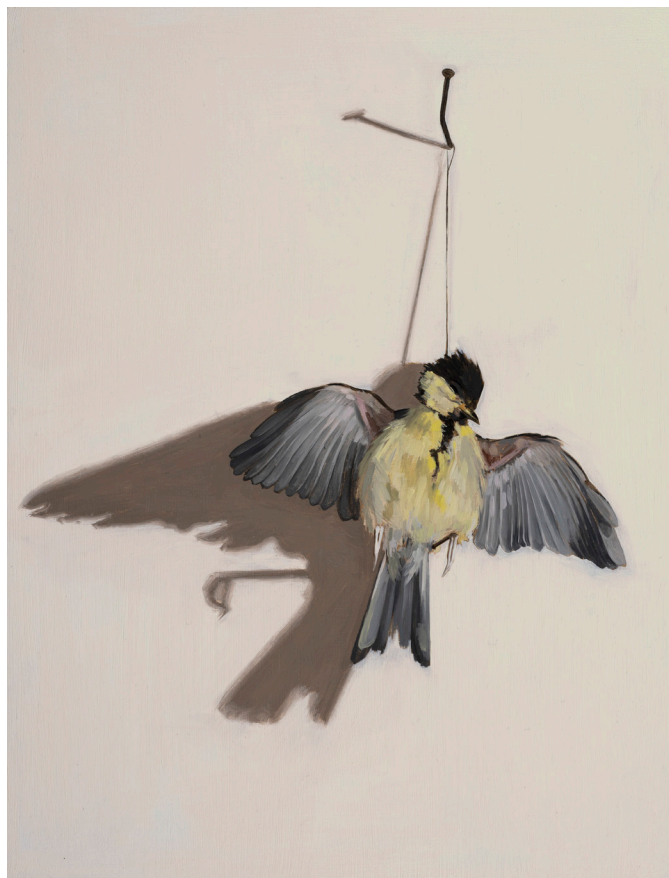
Memento Mori X 2018 Oil on board 21.5 x 17cm